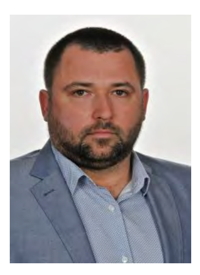
Dear Ms. & Mr. Presidents, Dear Sports Friends,

The Polish Underwater Federation has the pleasure to invite you and your teams to participate in the Finswimming European Championship to be held in Wrocław from 2 to 9 of July 2017. Here you may find all information regarding the championships as well as all the forms necessary for your participation.